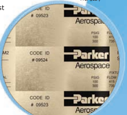
Multiple plate production in a single operation