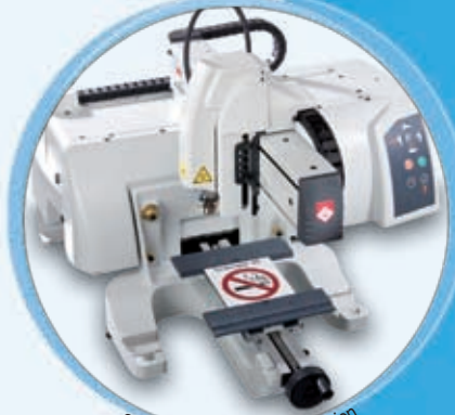
Standard engraving configuration for one-off jobs