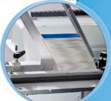
Able to hold over 312 plates