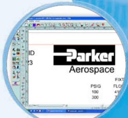
Exclusive software functionalities to optimise engraving productivity