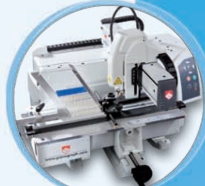
Simply slot APF in vice for high-volume engraving