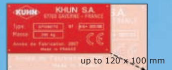
up to 120 x 100 mm